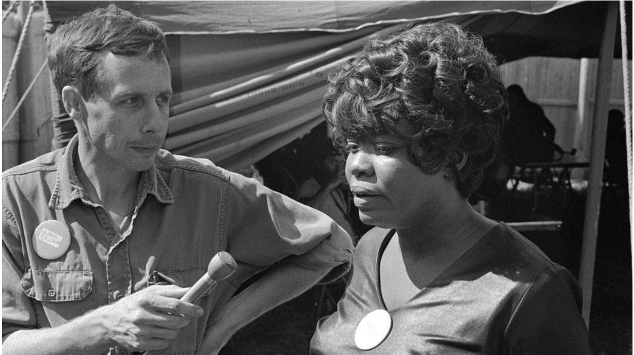
Michael Erlewine interviewing Koko Taylor.